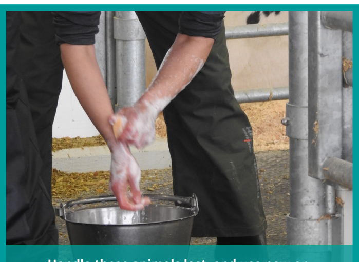
Handle these animals last, and use new or clean boots, coveralls, and gloves; remove after handling